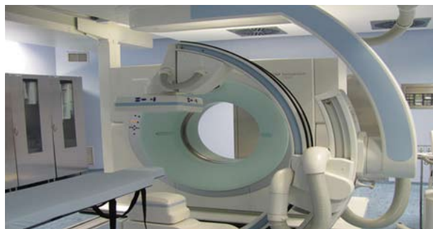
Hybrid Operation Room at the NCI of Bari

Istituto Tumori Giovanni Paolo II, Istituto di Ricovero e Cura a Carattere Scientifico Viale O. Flacco, 65 70124 Bari Italy